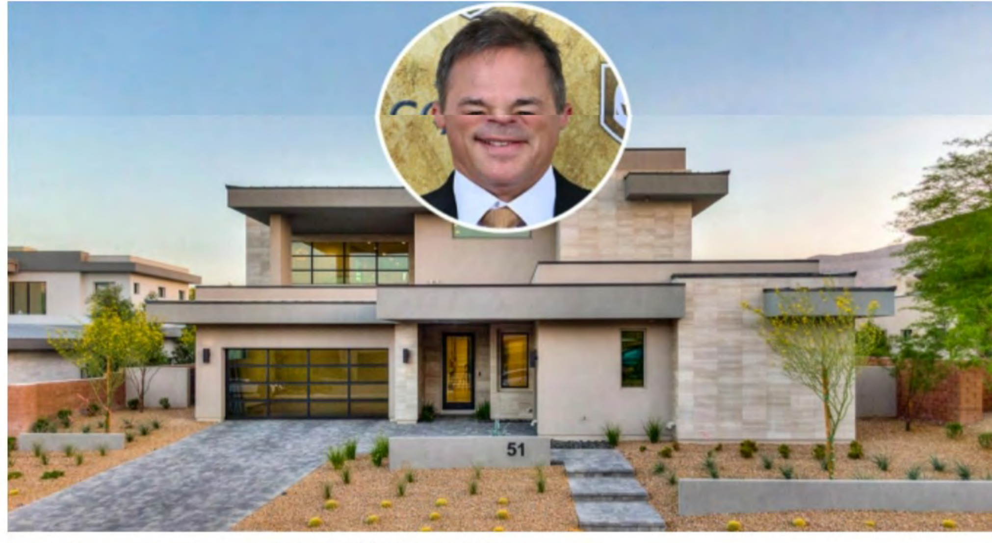
Luxury Homes of Las Vegas