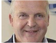
BBC to broadcast last moments of