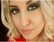
Revealed: Migrant boy, 15, arrested on