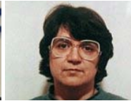
Serial killer Rose West becomes best