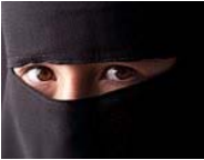
Ofsted rules head teachers CAN ban