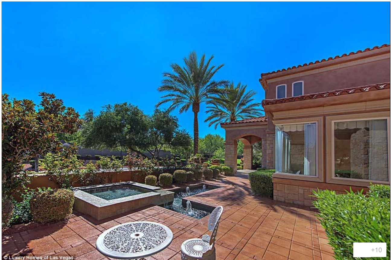
The new six-bedroom home is in a gated community and has two detached casitas, an outdoor fireplace, lush landscaping, marble flooring and a grand entry