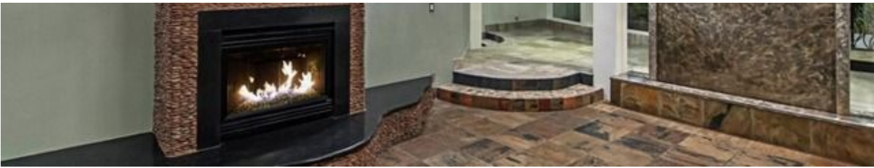
Tyson's old house has six bathrooms, three fireplaces, a pool, and an "LED rain shower." That's a strong bathroom-to-fireplace ratio.